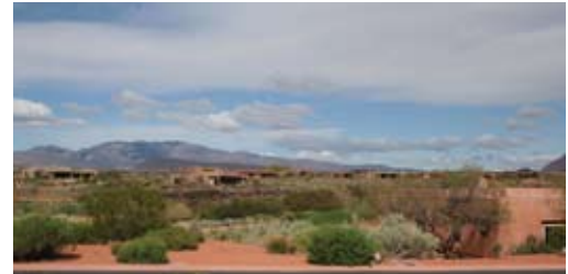
West view of Golf Course